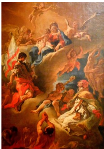
"The Virgin Mary intercedes for Purgatory's souls,"

Last week I spoke about the fact that there are no "stuck souls," that is, there are no deceased souls who remain attached to this world and cannot pass on to the next life without help. The Church firmly teaches that upon death we are immediately subject to our own particular judgment and are con-signed to heaven, hell, or purgatory.