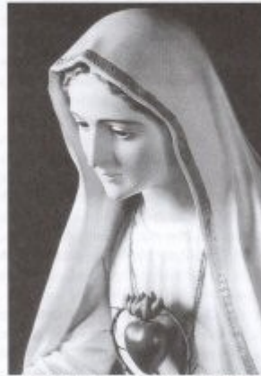
THE IMMACULATE HEART OF MARY

An indulgence of 3 years was granted for each prayer and a plenary indulgence under the usual conditions if recited daily for a month. (No. 334.)